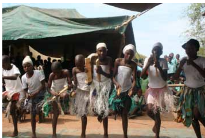
Dancing and singing about abolishing poaching