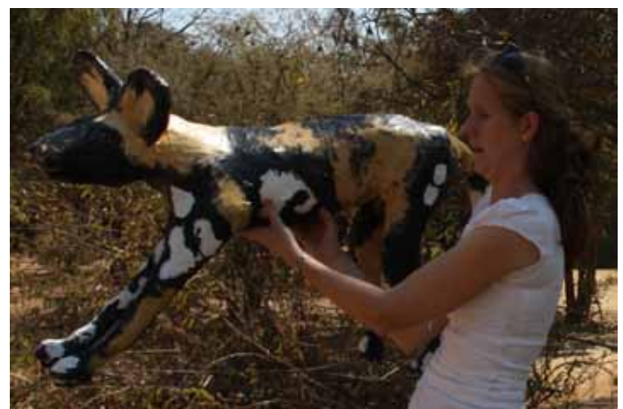
Students make wild dog models like this for judging.