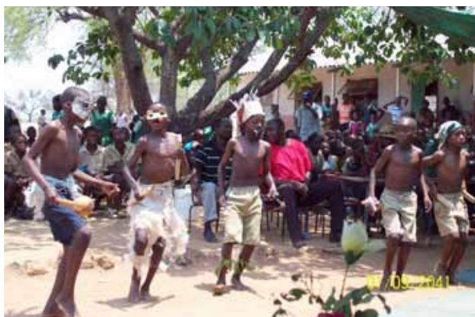
Wildlife Play - Chedutu Cluster Competition Day