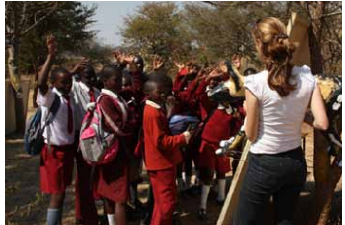
Fun quiz at the education day

We are very proud to once again be one of the few official charities of the Old Mutual Two Oceans Marathon ( www.twooceansmarathon.org.za/information/run-charity ). Last year we had an