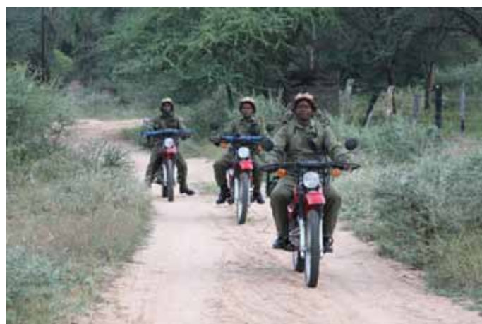
Scouts on motorbikes.

Monitoring data from this year shows a strong and stable population of African wild dogs. We currently know of 81 adult wild dogs in the conservancy and 56 pups (137 in total), with a potential additional 10 adults in three breakaway packs. At the moment, we have 60% pup survival with 56 of our 93 pups on first emergence (across 10 breeding packs and including two beta litters) still alive. This is a promising pup survival rate as few pups normally survive to 6 months, and even fewer to 1 year. For example, last year only 25% (17 out of 68 pups on first emergence) survived to one year.