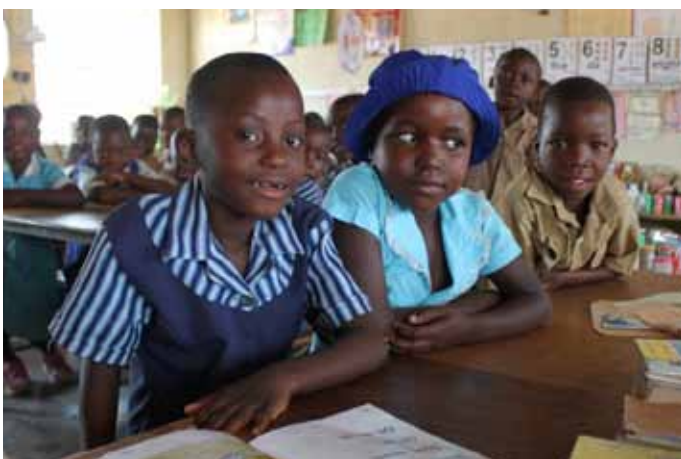
Young happy readers!

The Gonarezhou Predator Project team worked extensively in the park from May to October 2014. We have documented evidence of at least 10 different packs of wild dogs in the park, and it is likely that there