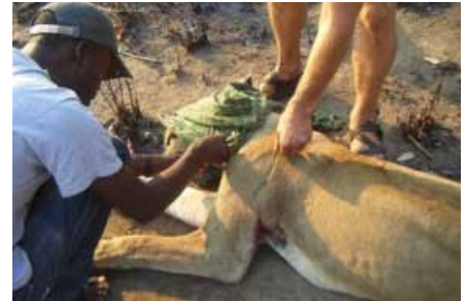
De-snaring a lioness after tracking her pride for a month over some of Luangwa's most remote and rugged terrain.

The paper, authored by a wide array of scientists and managers across Africa, provided a framework and research agenda to address