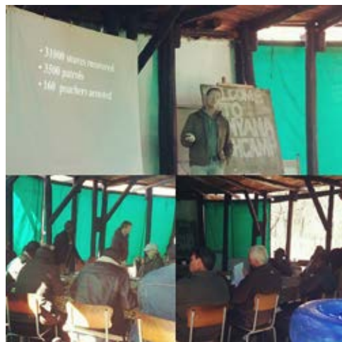
Top to bottom: Stakeholders meeting. Ange and Jealous.