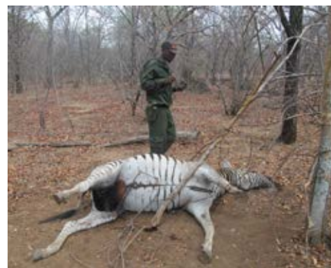
AWCF scouts assist with snare sweeps.

the GNP in August 2016 (the last survey was completed in 2010). This data contributes to long term trend data for both the SVC and GNP, and the data suggests positive results for the large carnivore populations in both wildlife areas.