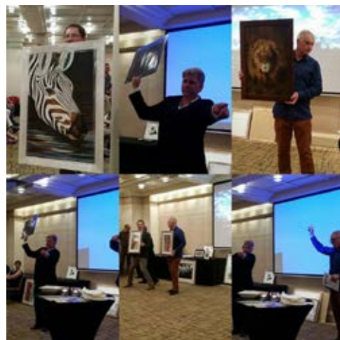
The auction in full swing!

A great result with approximately $20,000 raised on the night-so thank you to everyone that attended and made a real difference to our frontline projects.