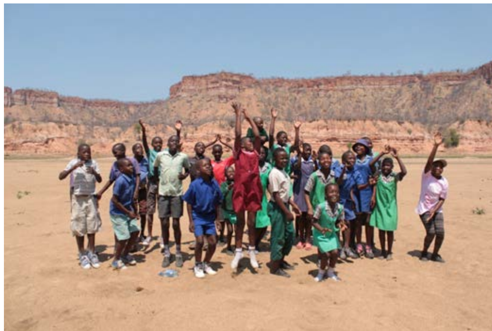
Above and right: Children enjoying their daytrip into Gonarezhou National Park.

The reactions of the children whilst out on these day trips is truly inspiring, and we have no doubt that these field trips will help to instil an appreciation for wildlife and conservation in the children.